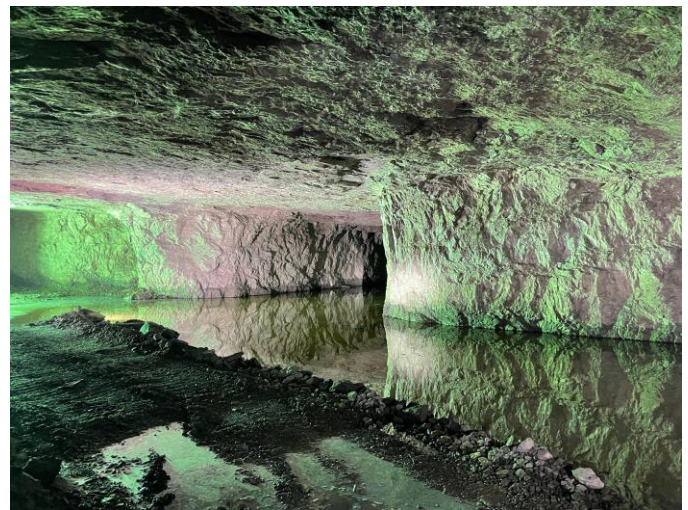
Figure 4: IMDC underground lake, leveraging geothermal cooling.

the U.S Department of Energy's Better Building Challenge, and the UK's Climate Change Agreement. These targets and objectives often coincide with improvement projects that enhance things like air management, equipment efficiency, building management system tuning, and in some cases, large capital projects to refresh facility supporting infrastructure. This action confirms improvement, or those sites that miss the target in accordance with PUE and ISO 30134.