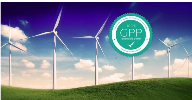
Figure 3: Green Power Pass giving renewable energy to all customers, with third party verification.

IMDC has been very fortunate to reap the benefits of ISO 50001 both internally, and externally. Our initial participation in the U.S Department of Energy's Better Buildings Data Center challenge came with energy efficiency targets and commitments, which in 2019, we achieved, becoming only the 3rd data center in the country to become a D.O.E Better Buildings Goal achiever. Our accolades in energy management and efficiency also extended into 2021 when IMDC was recognized by the Department of Energy, and the Industry, for Market Transformation as a Gold Level Green Lease Leader, which attests to our enablement of green and sustainable practices in a landlord/tenant relationship, driving energy efficiency and renewable energy use. Additionally, utilizing the rigor of the audit and data tracking within ISO 50001, IMDC has developed a revolutionary, first in the industry product which passes our renewable energy allocations through to our customers, also known as Green Power Pass.