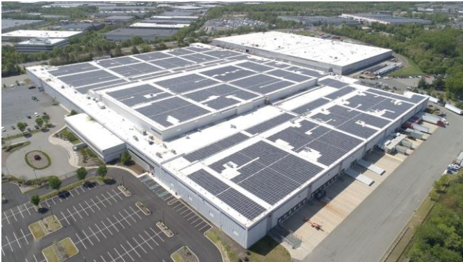
Figure 1: IMDC 7.2 MW solar installation, Edison, NJ

Due to the energy intensive nature of data centers, and the start of the US Department of Energy's Better Buildings Data Center Challenge which IMDC signed on for, IMDC had the forethought to adopt the ISO 50001 standard for all sites in our portfolio in order to drive continual improvement of energy performance, as well as rigor, and third party verification of energy data. Since 2017, IMDC has been ISO 50001 certified across our entire footprint, making us the only globally certified data center provider with ISO 50001. Through multiple greenfield builds and acquisitions the adoption of ISO 50001 as a management system has allowed IMDC to guide the business toward a more responsible and sustainable future for our shareholders, our customers and our planet.