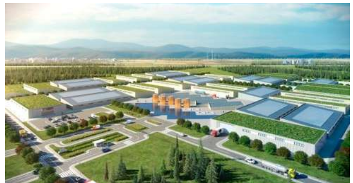
Nuclear ENERGY technology integrated with solar photovoltaics and wind turbines to power a modern data center, illustrations courtesy of Third Way: https://advancednuclearenergy.org/blog/nuclear-reimagined

“ This initiative will bring the wisdom of the world on nuclear innovation together, and contribute to policy making for realising clean energy systems that solve challenges in each country. ”