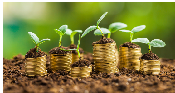
Energy policies that influence investment in clean energy

90% of global clean energy investments are made by the CEM Members