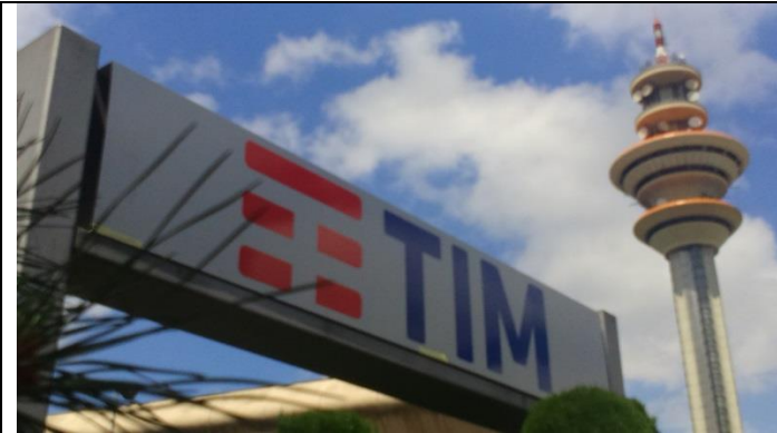
A view of Data Center in Rozzano

for this reason, it is essential to keep under control all point of energy consumption.