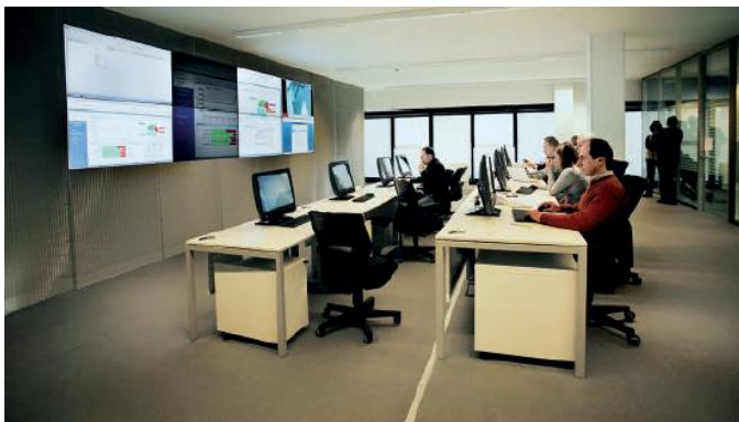
Figure 2: monitoring at Smart Center

The number of fixed and mobile network sites with sensors was 2,768 in the year 2015.