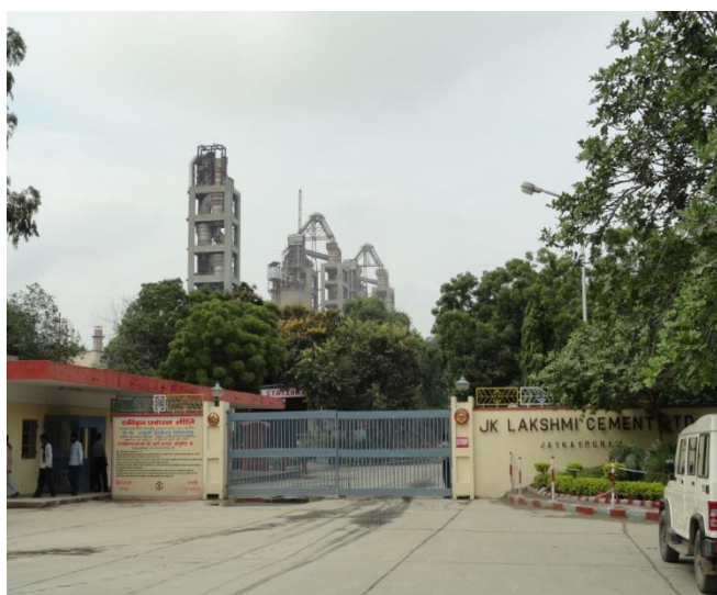
JK LAKSHMI CEMENT LTD – JAYKAYPURAM, SIROHI PLANT

Successfully achieved 14.82% reduction in the SEC, as against given target of 4.91% during “PAT”- Cycle-1 (SEC= Specific Energy Consumption)