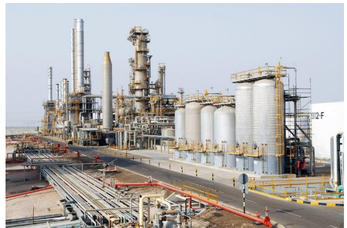
Abu Dhabi Refinery triumphed to Quartile 1 in Energy Intensity Index (EII) of Solomon Benchmarking for 2014.

Through the Energy Management Working Group (EMWG), government officials worldwide share best practices and leverage their collective knowledge and experience to create high-impact national programs that accelerate the use of energy management systems in industry and commercial buildings. The EMWG was launched in 2010 by the Clean Energy Ministerial (CEM) and International Partnership for Energy Efficiency Cooperation (IPEEC).